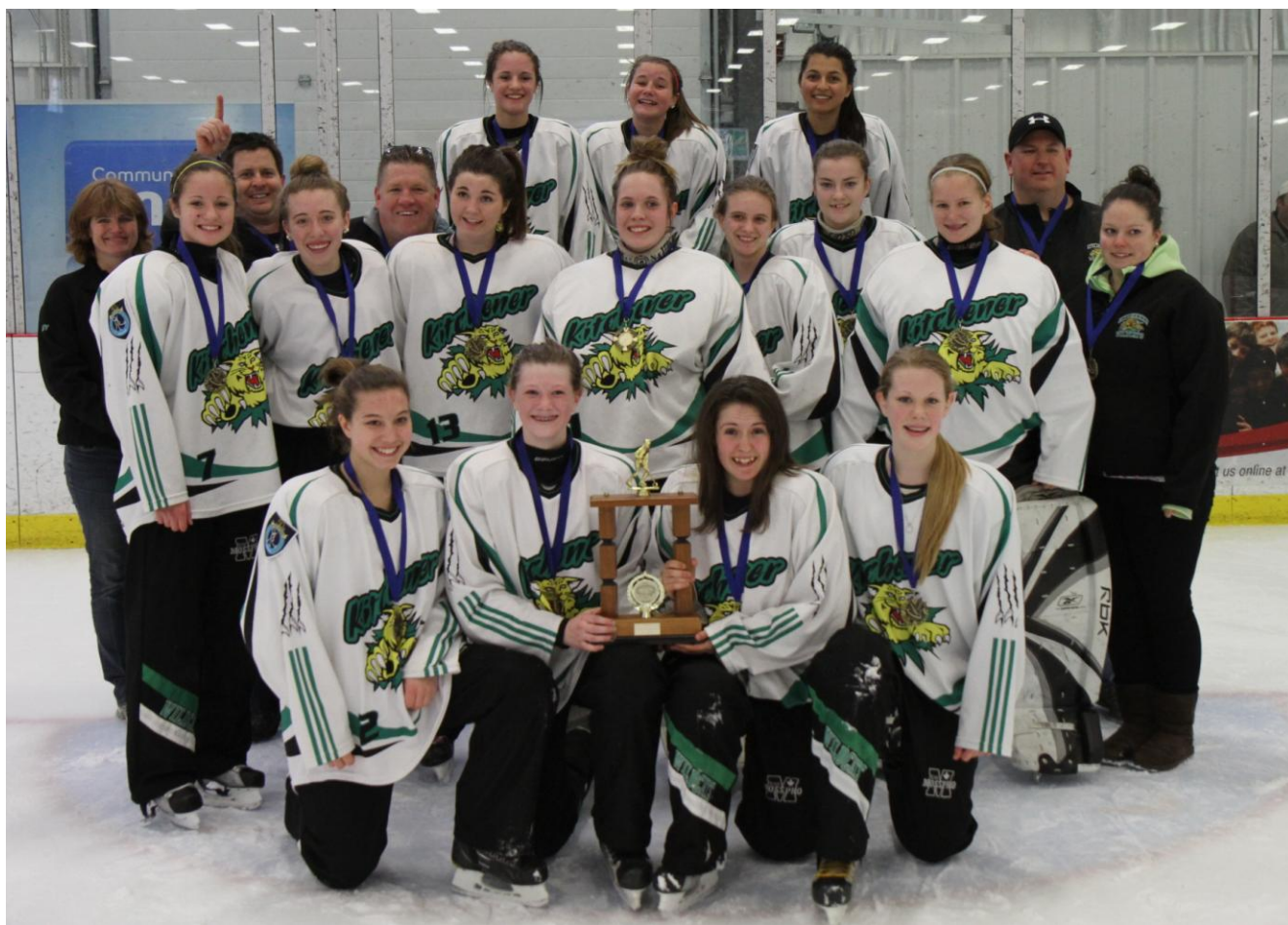
U16A Eastern Gold Medal Winners Kitchener Rangers