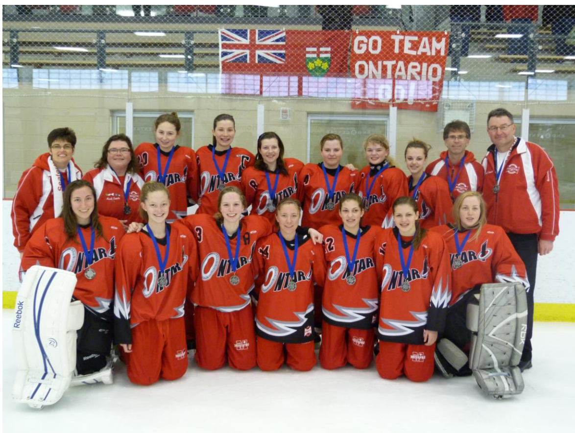
U16A Eastern Silver Medal Winners Team Ontario (Seaforth)