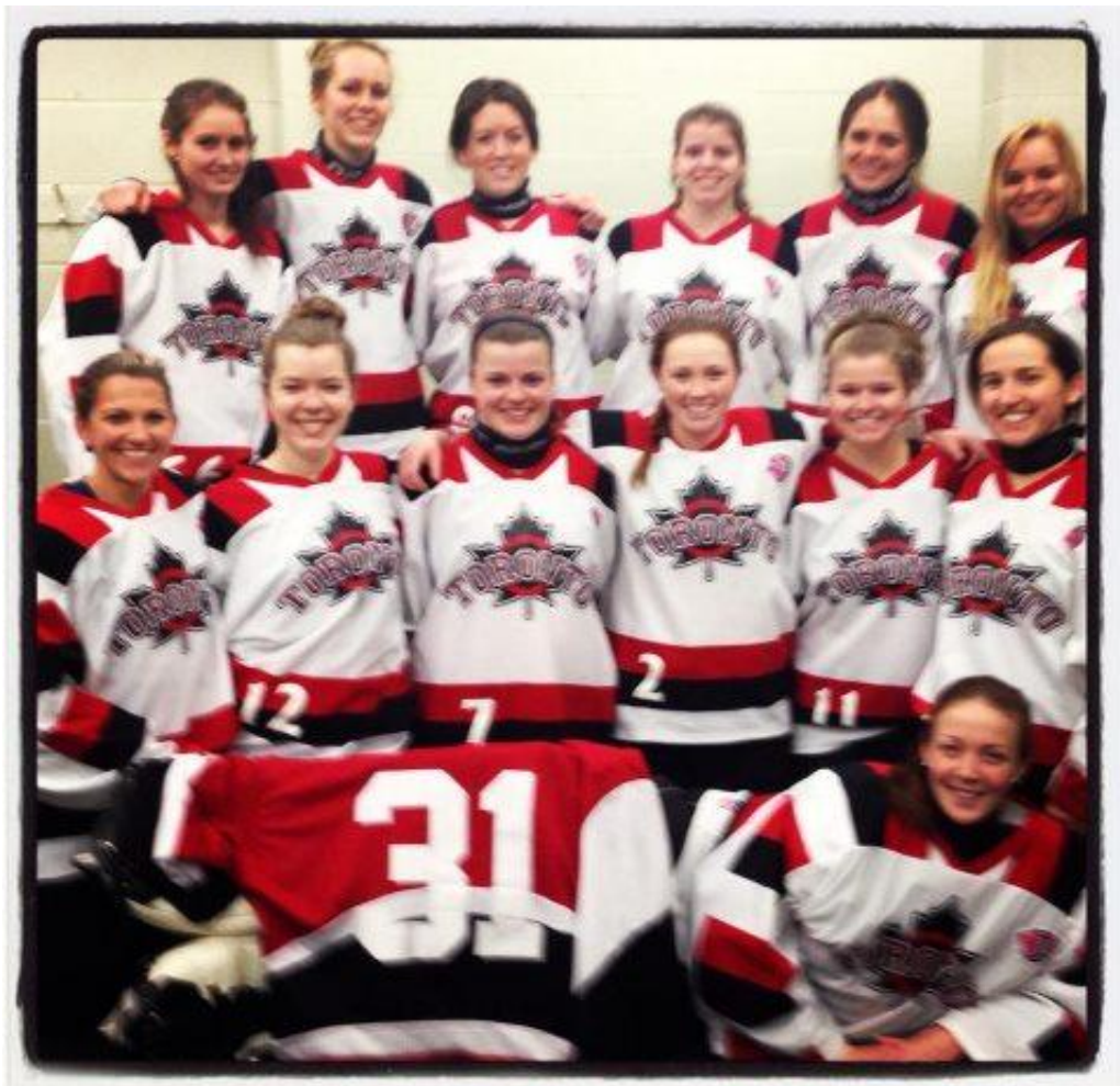
18+A Easterns Silver Medal Winners Team Ontario (Toronto)