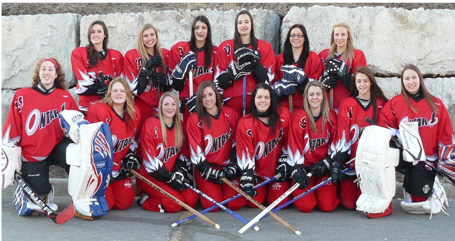
U16AA Canadian Ringette Championship Bronze Medal Winners Team Ontario (Guelph Predators)