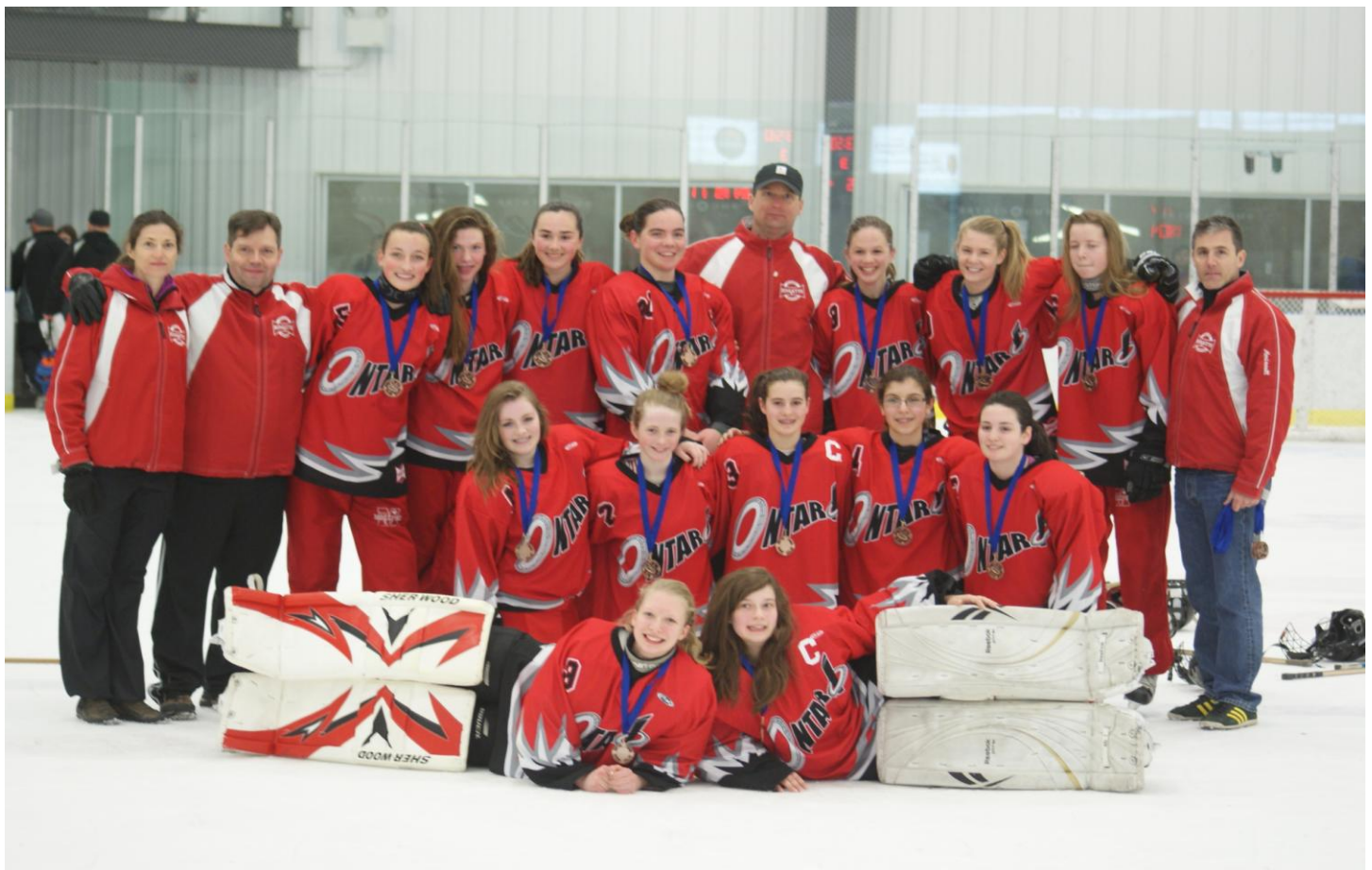
U14AA Easterns Bronze Medalist Team Ontario (Ottawa Ice)