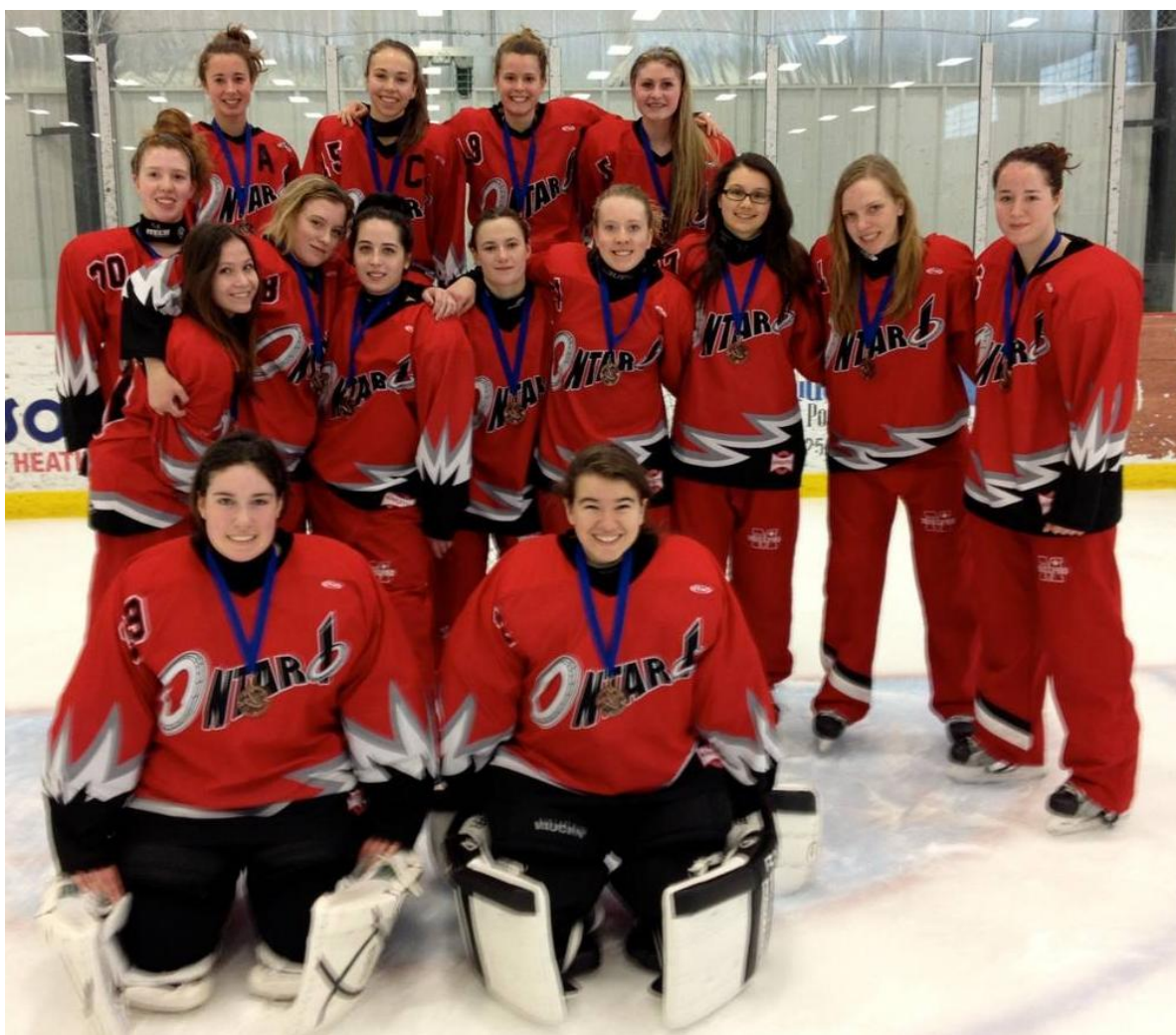
U19A Eastern Bronze Medal Winners Team Ontario (Ottawa Ice)