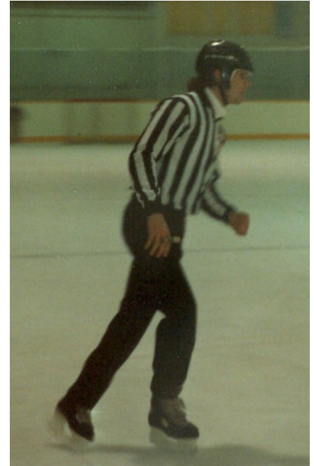
(Me in 1988)

I have officiated or supervised at Provincials since 1990 and officiated at Nationals since 1993. I’ve seen many officials come and go over those years, including myself. If there truly is a “secret handshake,” I have yet to see it. What I do know is that to progress and succeed, you need to be able to perform, look the part and be professional. And, if you combine these three traits with exposure, you will get closer to your goal.